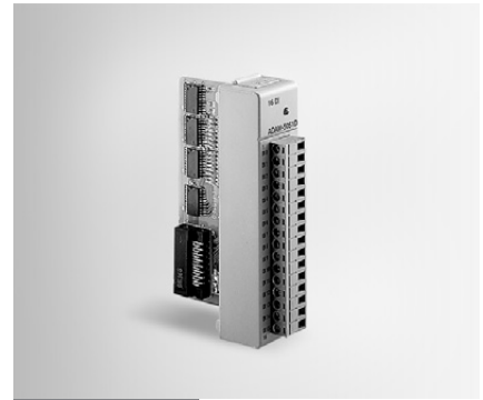
ADAM-5051 ADAM-5051D ADAM-5051S