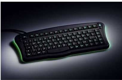
DS86W HL ▶

Here is a selection of similar keyboards. Are you interested in any of the following solutions? Just get in touch with us.