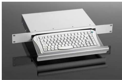
DS 86W Drawer