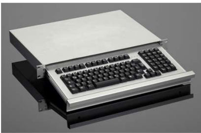
DS 104W Drawer

Here is a selection of other drawer keyboards. Are you interested in any of the following solutions? Just get in touch with us.