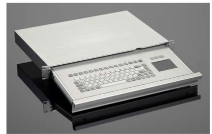
DS 83S-TP Drawer